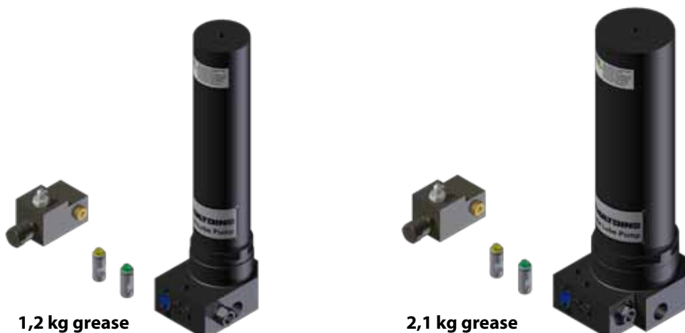
1,2 kg grease