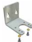
Bracket kit LD