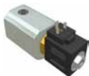
Electric shut off valve