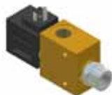
Float position valve